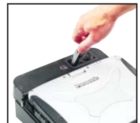
Easy-to-use "lift-and-turn" compression latch