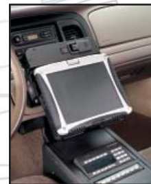
Vertical Tablet Position