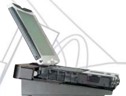
Flat Surface/Trunk Docking Station