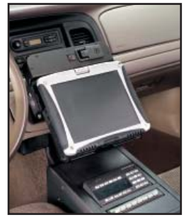
Vertical Tablet Position