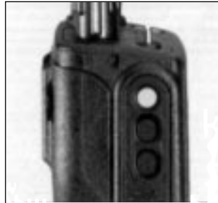
Programmable buttons and switches

2 Channel models are not compatible with Public Safety microphone or MTVA (Mobile Vehicular Adaptor).