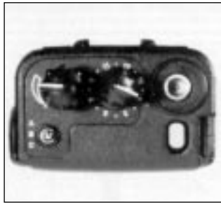
Easy access controls