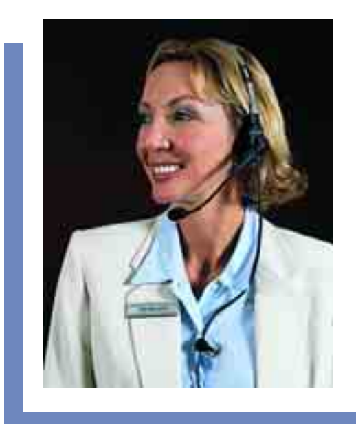
HMN9013A Lightweight Single-Muff Headset

Behind-the-head style can be conveniently worn with most hard hats. Noise-reduction rating of 24dB. High-clarity sound with the additional hearing protection necessary for providing virtually constant, clear radio communication in harsh, noisy situations.