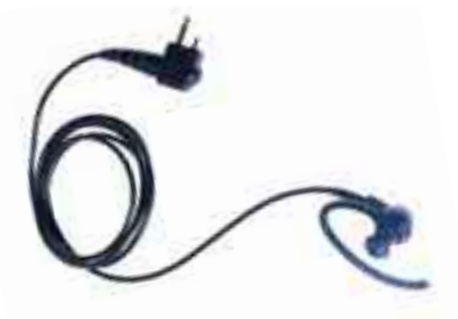
RLN4894A Black Receive-Only Earpiece

HMN9752B – Beige Receive-Only Earpiece with Volume Control