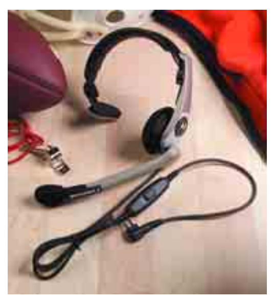
RLN5238A NFL®-Style Lightweight, Single-Muff Headset with In-line Push-to-Talk