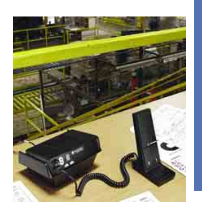
The PM400 is compatible with most Motorola portable and mobile radio accessories.