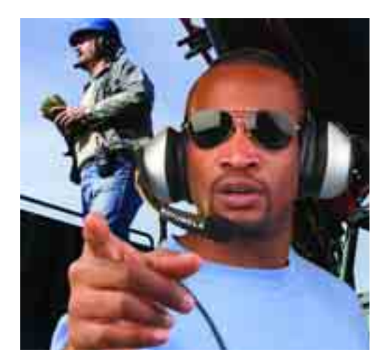
RMN5015A Racing Headset