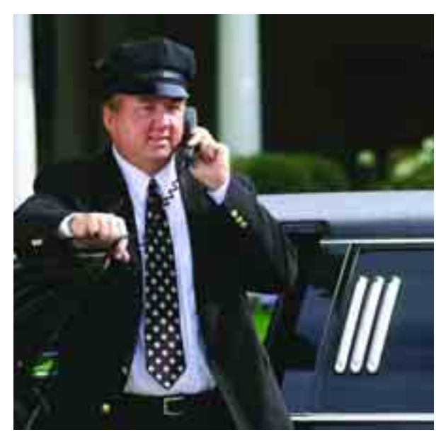
Telephone-Style Handset is ideal for users wanting to conduct private conversations.