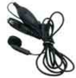
HMN9036A Earbud with Microphone and Push-to-Talk