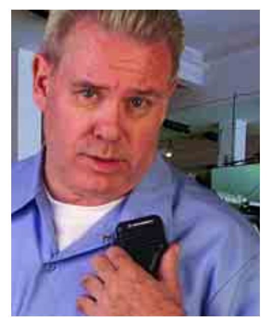
HMN9030A Remote Speaker Microphone