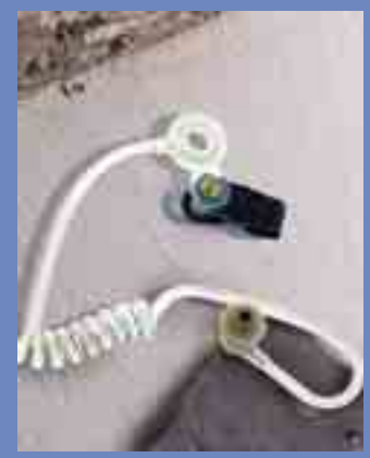
NTN8371A Low-Noise Kit