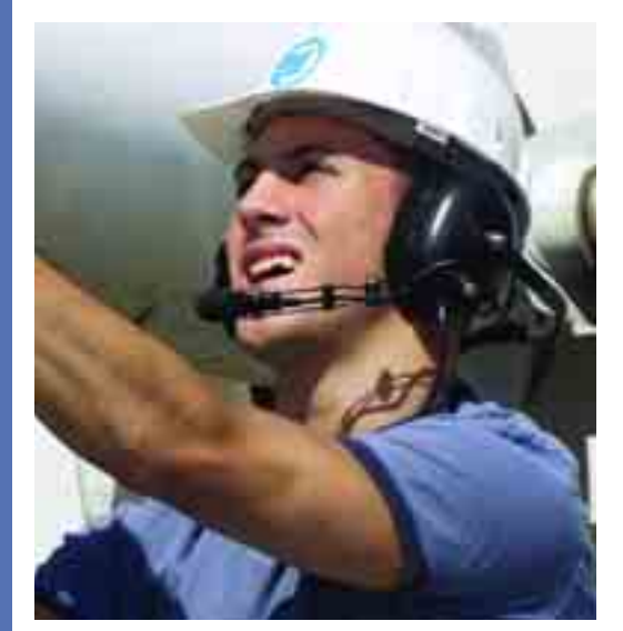
HMN9021A Medium-Weight Dual-Muff Headset

For use with PR400 two-way radio and RMN5015A Racing Headset.