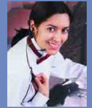
PMMN4001A Ultra-Light Earpiece with Microphone and In-line PTT

RLN4763A Custom Clear Comfortable Earpiece