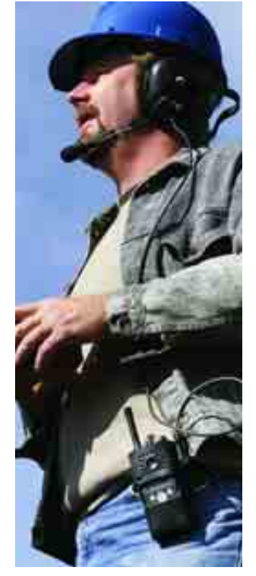
RLN5641A Hard Leather Carry Case with 2.5-Inch Belt Loop