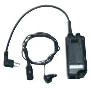
BDN6646C Ear Microphone System, with PTT Interface

RLN5500A – Accessory Retainer Clip Holds audio accessories securely to radio.