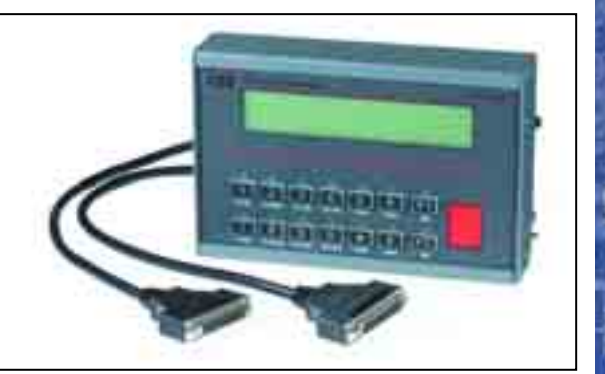
RDN7368A Mobile Display Terminal