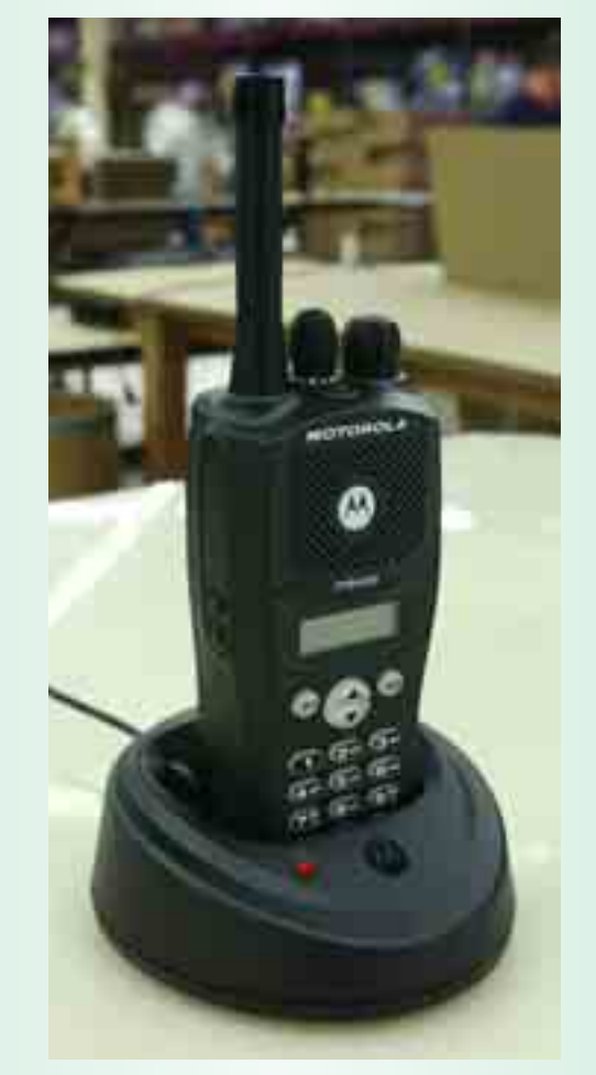
WPLN4138AR Desktop Rapid 90-Minute Charger