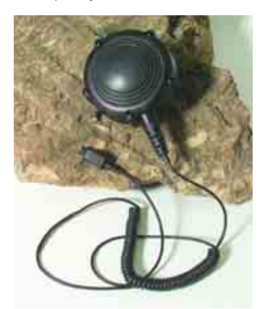
0180300E83 Body Switch Push-to-Talk