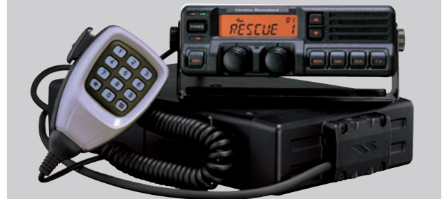
REMOTE MOUNT CONFIGURATION