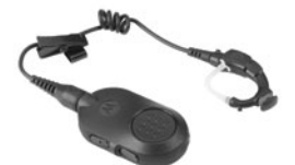
Operations Critical Wireless Earpiece

"When I first saw the MOTOTRBO SL Series I thought that it was a cell phone, not an actual two-way radio. It has all the capabilities of a two-way radio but with a professional, discreet look that fits absolutely well with all our uniforms."