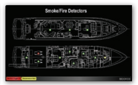
TSM800 Screen Shots