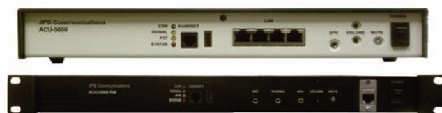
Photo caption: Top: ACU-5000 table top version. Bottom: ACU-5000 rack mount version.