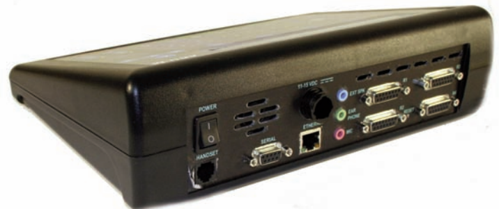
Photo caption: Upper: An ACU-M top panel showing LED indicators reflecting connection status and diagnostics for each port. Bottom: Rear view of ACU-M featuring audio, Ethernet, serial and power ports.

Sales Inquiries: publicsafetysales@raytheon.com