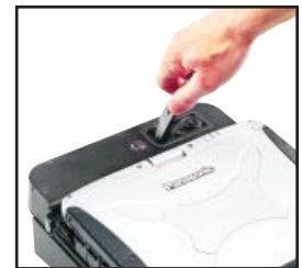
Easy-to-use "lift-and-turn" compression latch