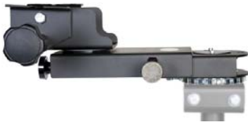
Locking Slide Arm in 9" locked position