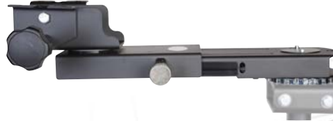
Locking Slide Arm fully extended in 13" position