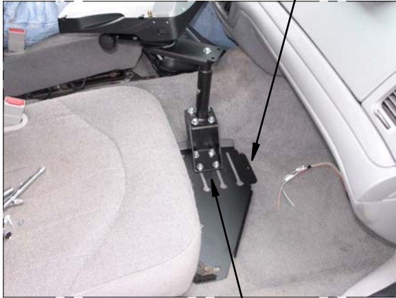
Fig. 2 Completed assembly