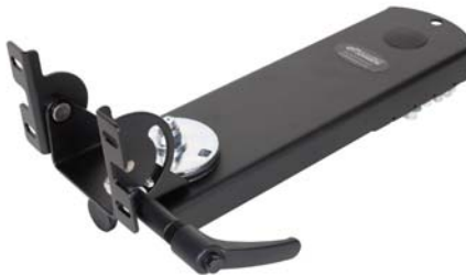
Tilt Shown: 90° fore