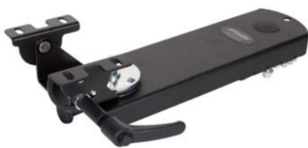
Tilt Shown: 30° aft