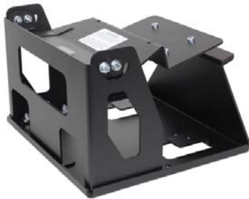
Police Tour-Pak Mount in closed position