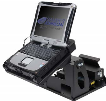
Police Tour-Pak Mount in open position with Computer and Printer mount