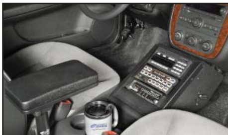
installed in a Chevrolet Impala