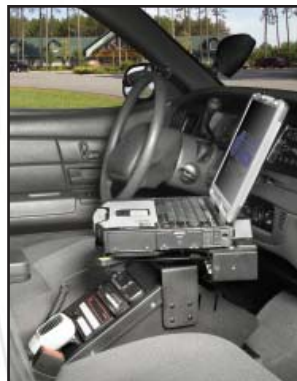
installed in a Ford Crown Victoria