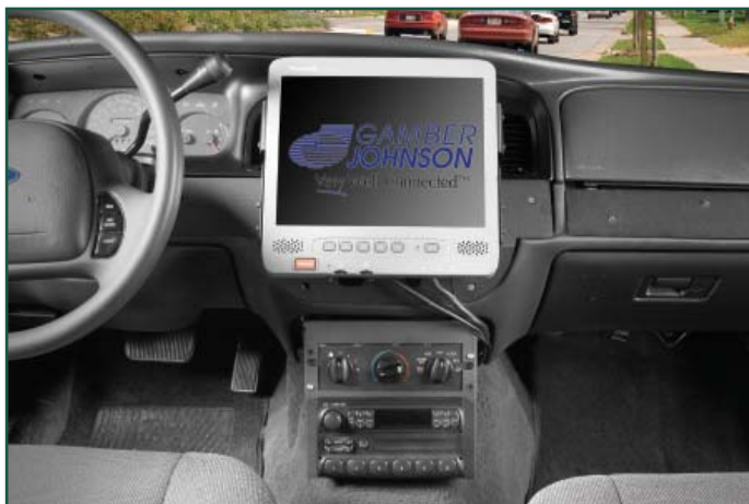
Shown with MCS-RELOBOX