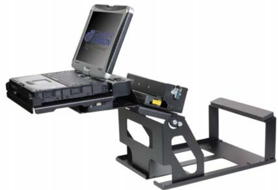
Tour-Pak Mount with Toughbook 19 Docking Station and Printer Mount