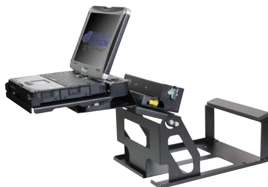
7160-0035 shown with complete Harley-Davidson Motorcycle Mount (7160-0034)