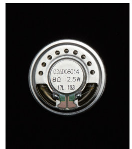
Icom custom high power handling capacity speaker