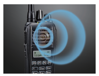
1500 mW powerful audio