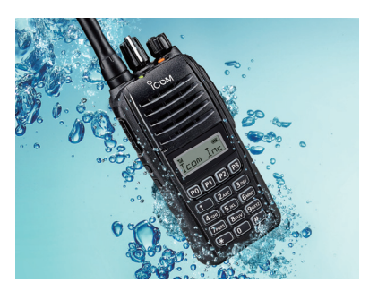
Waterproof for 30 minutes at one meter