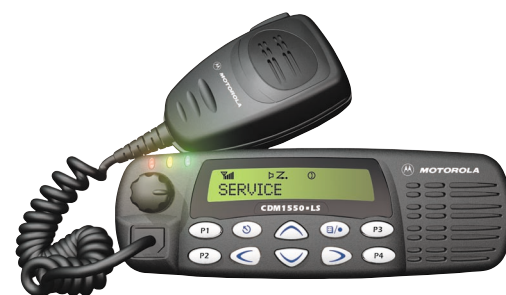
CDM1550-LS with LTR® Trunking

At the touch of a button, two-way radio lets you talk with one, ten, or more people instantly – providing the individual and team communication you need to maximize productivity and meet your customers' demands. And when you choose a Motorola radio, you know you're getting a product designed to meet your requirements as a professional.