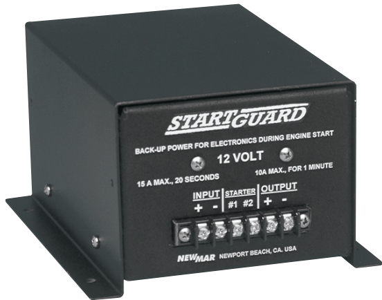
Provides Voltage Protection During Engine Start

The abrupt DC system voltage drop that accompanies engine starting can cause microprocessor-based voice and data transmitters to "dump" programmed memory.