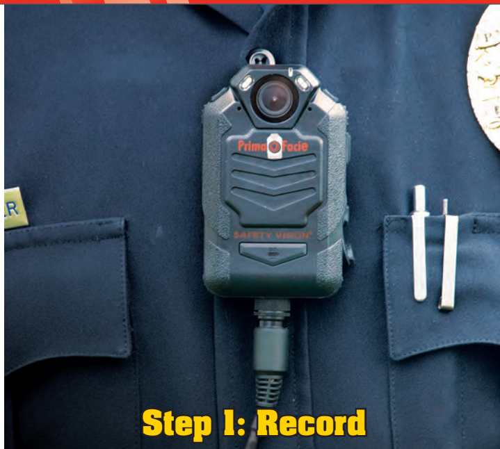
Step 1: Record